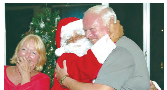
Town & River Cruise Club member posing with Santa.