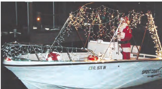
Decorated and ready for the parade