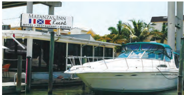
Boaters docking at Matanzas Inn

A great group of members gathered at the Matanzas Inn for a terrific view of San Carlos Bay, a wonderful lunch, and great conversation. Prizes, provided by the hosts, were given