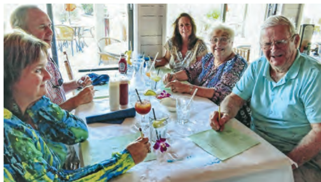
Hard at work to complete the word search