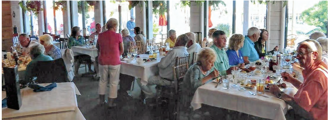
Delicious food and more conversation