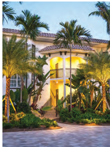
Lighting creates attraction to your landscaping at night.

It is important to remember that landscapes are living and growing entities that evolve over time. Proper care, maintenance and planning can keep your landscape looking fresh during every season.