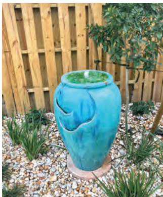
Self-contained recirculating water jar with sea glass and colored light to add evening interest

1. Create a plan and establish a budget. A plan for your landscape vision is the most important step for improving any landscape. Oftentimes homeowners have a figure in mind that they would like to spend while the landscape vision they wish to create is not in line with that figure. The best way to deconstruct the numbers is to create a landscape plan that encompasses all of the items on the client's wish list and then prepare a budget and evaluate the numbers to execute the project.