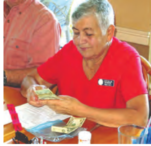
The club's secretary counts the 50/50 money.