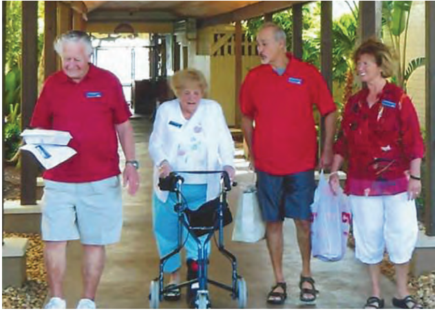
Happy diners leave the Valentine's Day event at the Three Fishermen.

The Town & River Cruise Club held its Valentine's Luncheon on Feb. 16, at the Three Fishermen restaurant. The weather was beautiful and over 35 members and guests arrived by boat and car. The restaurant was decorated for the occasion and various games were enjoyed by all after a wonderful lunch. A good time was had by all.