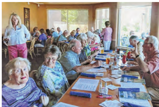
Club members try to complete the Sailor's Superstitions Quiz.