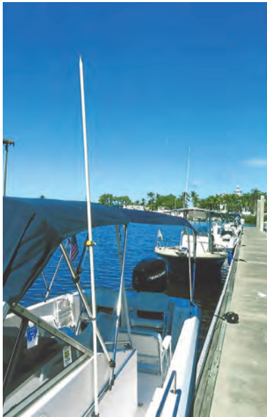
TRCC boats docked at the Lighthouse Restaurant.