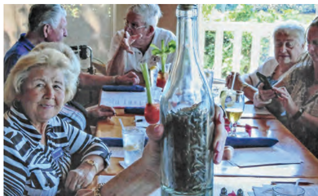
How many shark teeth are in this bottle?