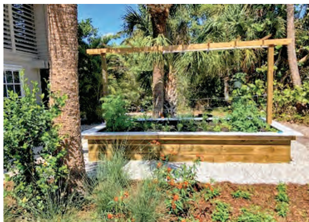
Custom designed and built raised vegetable garden