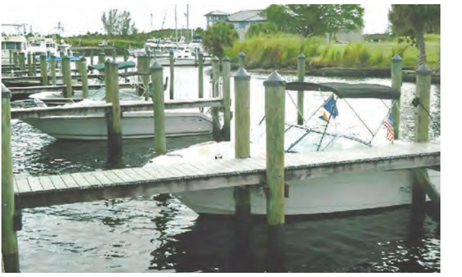
Many members arrived by boat.

The weather was cooperative and over 25 members and guests arrived by boat and car. This restaurant is fairly new and provided a nice venue for our first gathering and