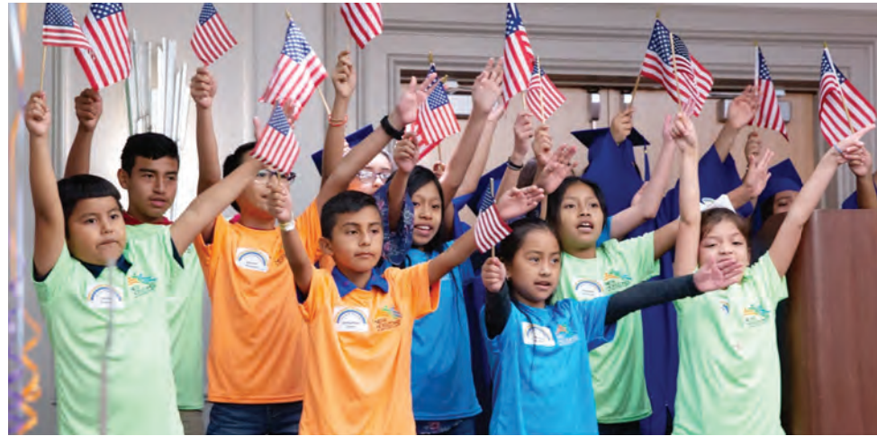
New Horizons Choir, who will perform at the 2020 luncheon

newhorizonsofswfl.org, www.newhorizonsofswfl.org