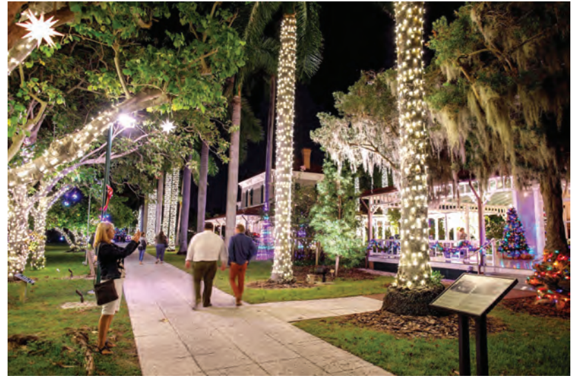
Visitors admire the decorated homes and gardens during Holiday Nights.

Edison and Ford Winter Estates is the internationally known winter homesite of Thomas Edison and Henry Ford. More than 220,000 visitors walk through the location each year from all around the globe. The organization has received many awards, including the