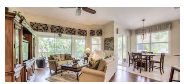
11037 Harbour Yacht Ct. #202 Mariposa at Gulf Harbour. Recently updated second floor unit, Move in ready & Fully Furnished offering over 2,200 sqft with 3 bedrooms & Den, 2 bath, and attached garage. Offered at $430,000

14530 Ocean Bluff Dr. Meticulously maintained private couple retreat. Just under 3000 sqft. Offering 3 bedrooms plus den, 2.5 baths, over sized garage with full third space and storage. Indoor-outdoor flow leading to private pool and spa nestled amongst mature trees and greenery. Offered at $825,000