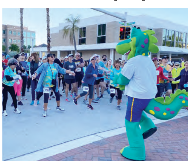
Plato leading the warm-up

For more information visit RunToTheArts.com or contact us at (239) 768-3602 or info@ArtFestFortMyers.com. Like us on Facebook. Follow us on Instagram. Tag us #artfestfm.