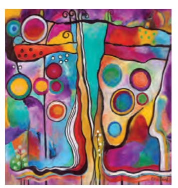
All Publix Run To 2021 Run T-shirt artwork

in-person or virtual, will receive a virtual swag bag with promotions and special coupons from ArtFest Fort Myers' friends and supporters.