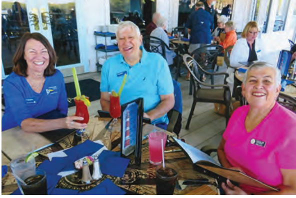
Town & River Cruise Club from page 1