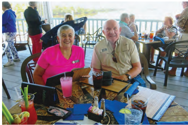
Delicious cocktails refreshed the thirsty boaters.