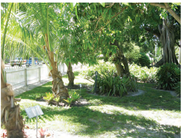
Mangoes and coconuts should be planted away from structures and driveways.