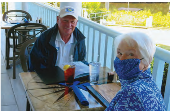
Club members discuss menu options after a pleasant cruise.