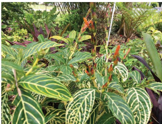
Sanchezia grows great in shade and provides a lovely foliage pattern.

What may have been partial sun during the first few years can eventually become full shade. Changing out plants and dividing and moving others around may be necessary to keep the area thriving. I assure you gardening is never a boring endeavor!