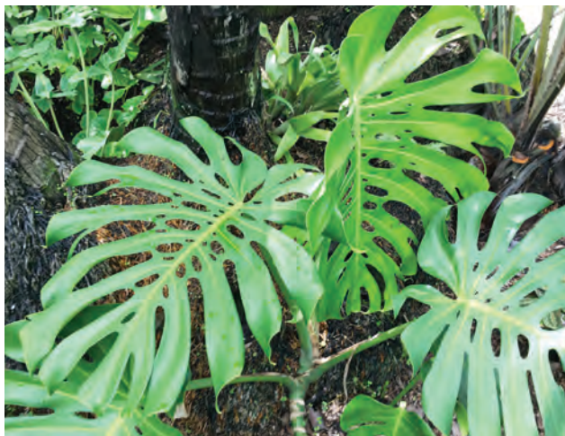
Monstera loves to grow up a tree in the shade.

Choose cultivars of fruit trees that remain smaller such as Mango "Ice Cream," "Pickering," or a little larger