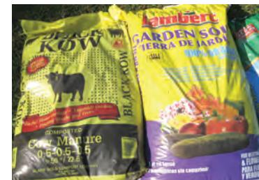
Amend the soil in raised beds or containers when planting vegetables.

There are several ways to grow tomato plants, and one of the best ideas is in a five-gallon bucket with holes drilled into the sides 1 inch above the bottom about every 4 inches. I suggest cherry tomatoes for the five-gallon buckets. If you want to grow a bigger size tomato, such as Better Boy or Better Girl, you will need at least a 10-gallon pot. If you look for containers, there are styles you can purchase such as Smartpots, Earth Boxes, self-watering plastic, and if you really want to pretty up the garden, try a beautiful ceramic pot. Don't forget to put a tomato cage in the pot while the plant is still small. At the time of planting, I use an organic tomato fertilizer made by Espoma brand, added to the planting hole and then side dress around the trunk of the plant. It is best to always read the directions for amounts to use. The plants should take anywhere from 60 to 90 days to produce flowers and tomatoes. You'll need to be patient. Full sun is a must as tomatoes need the sun to grow big and strong. I water the tomato every day for a while until I see the new growth, and then reduce watering, depending on the air temperature.