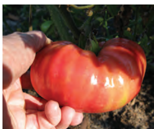
Now is the time to start growing vegetables, such as carrots and tomatoes.