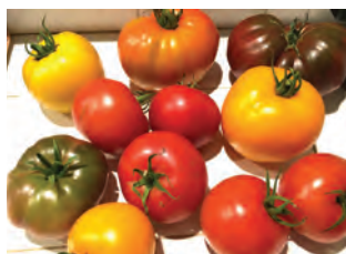
There are many tomato varieties that can be grown from seed.

I remember tomatoes that we grew in Illinois tasted really good. The grocery store tomatoes, in my opinion, lack flavor. I'm not sure if tomatoes today are allowed to turn red on the vine, but instead are picked early before flavor can be imparted. I remember eating very flavorful tomatoes as a child. In our home, our mantra was "gotta have a vegetable garden." Our kitchen in August was full of tomatoes that were piled high on the counter, ready for salad or a BLT sandwich. Any tomatoes not eaten fresh were canned in Mason jars, so they would be ready for future chili and spaghetti sauce. I don't remember the varieties of tomatoes we grew – beefsteak was probably one of them. Whatever was left before frost that didn't turn the typical red was enjoyed as fried green tomatoes.