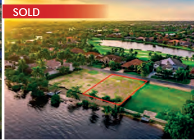
$2,150,000 11380 LONGWATER CHASE CT