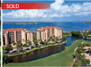
$809,900 11600 COURT OF PALMS 304 Representing Buyer