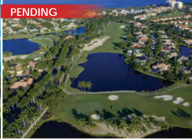
$1,100,000 11480 LONGWATER CHASE CT Beautiful Lake Views in Prestigious Gulf Harbour