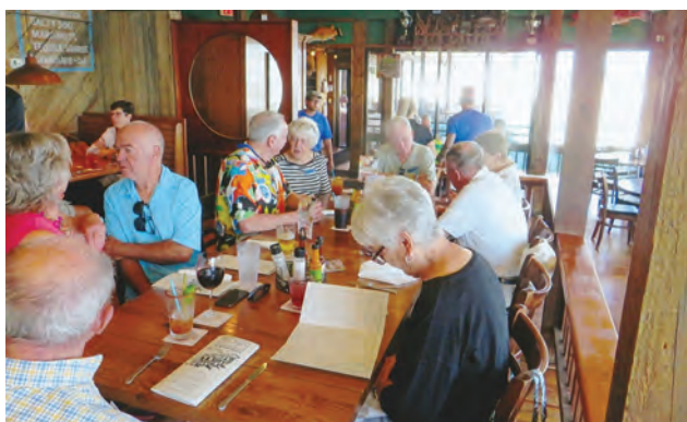
The club members enjoyed visiting with each other throughout the meal.