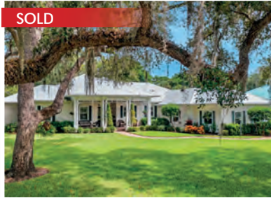
$1,150,000 12430 COCONUT CREEK CT