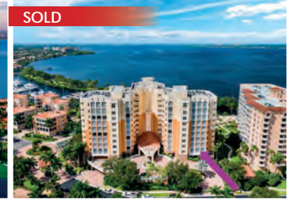
$1,425,000 14270 ROYAL HARBOUR CT 319