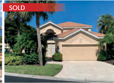
$735,000 14765 OSPREY POINT DR