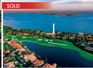
$2,050,000 11370 LONGWATER CHASE CT