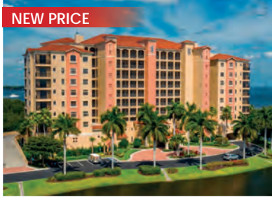
$675,000 11600 COURT OF PALMS 206 Elegant Waterfront Living in Prestigious Gulf Harbour

FULL TIME GLOBAL REAL ESTATE ADVISORS - REACH FOR THE STARRS