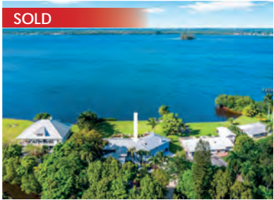
$1,200,000 144 RIVERVIEW RD