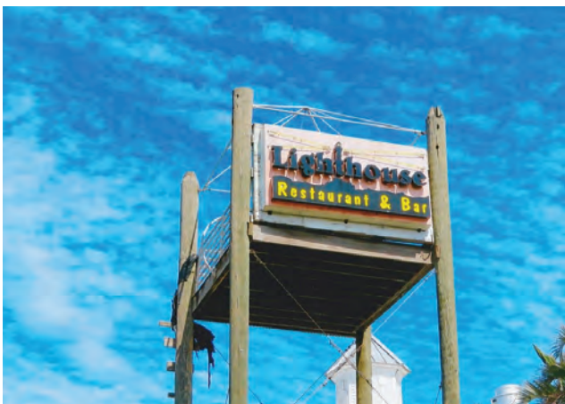
The T&R Cruise Club celebrated Valentine's Day on a gorgeous day.