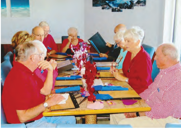
The "Special of the Day" sounded great.