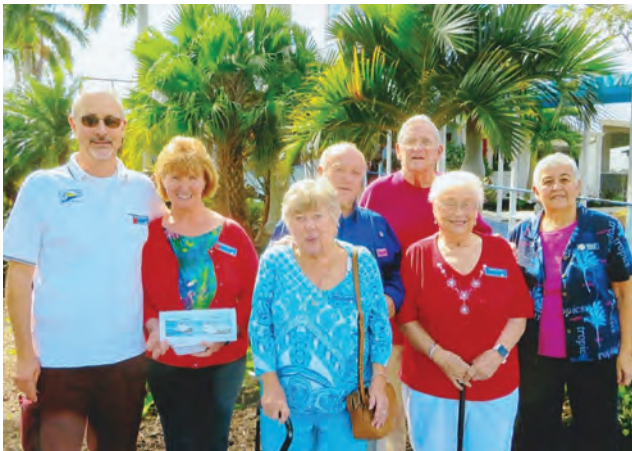
An enthusiastic group arrived at the Lighthouse.