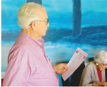
Playing bingo is serious business every year.