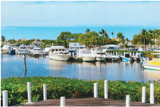
The view from the dining area is simply amazing.