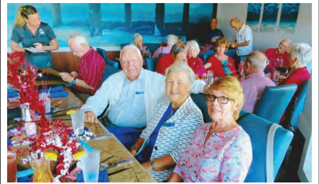
Old friends enjoyed being together again.