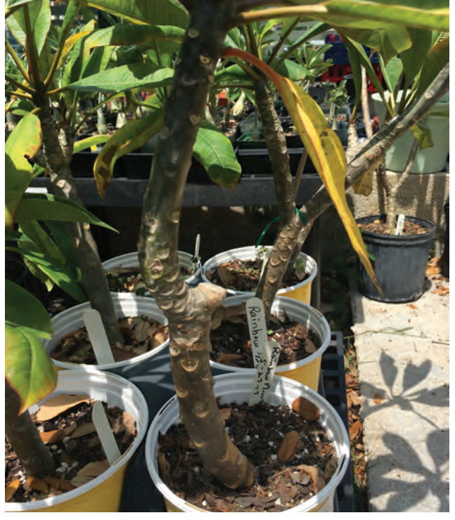
Cuttings in the nursery at Edison and Ford Winter Estates

Frangipani are fun to share with friends and neighbors, especially if you are looking for named varieties in colors of red, two-toned pinks and yellow and orange and yellow, deep pink, light pink, peachy, and many more variations thereof. Growing plumerias from cuttings is by far the best way to propagate new plants for your garden. All you have to do is cut a branch 1 to 2 feet in length from an existing plant you desire, then set it aside for a couple of days while the end that was cut callouses or heals over, then when it's ready, push the cutting into the pot of adequate draining soil about 3 to