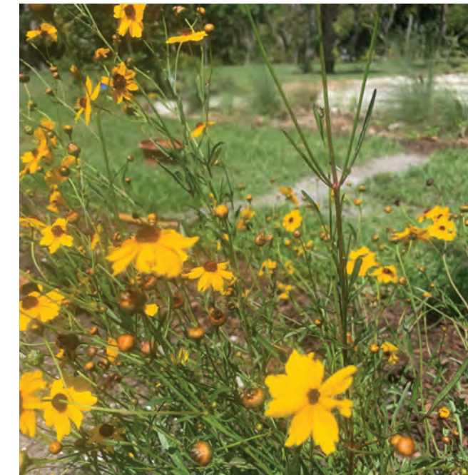
Coreopsis leavenworthii is the Florida state wildflower.

I've planted include Coreopsis leavenworthii (the Florida state wildflower), black-eyed Susan, pineland heliotrope, tropical sage, twinflower, beebalm/dotted horsemint, silk grass, blueeyed grass, Liatris, false rosemary, Elliott's lovegrass, and muhly grass. Soon, I'll be adding even more!