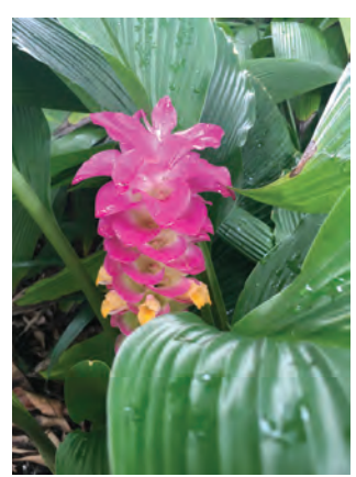
Curcuma also known as Siam tulip loves summer rains and heat but needs to be planted in a shady spot.

angel trumpet, ginger, and other ornamentals - now that it's raining regularly again, those plants will start growing.