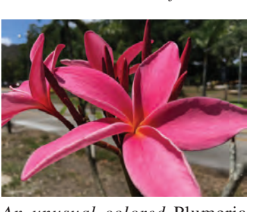
the winter months, these rubra variety growing in the frangipani collection at Edison

Another easy-care plant for the garden (not native, but still easy to love) is the plumeria or frangipani. They range in colors of white with a yellow throat, to many shades of pink, red, or reddish-orange. During An unusual colored Plumeria small trees are denuded of their leaves, leaving and Ford Winter Estates some to ask, "Are they