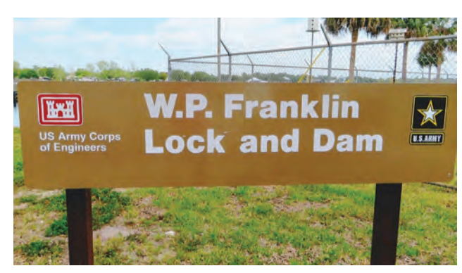
The Town & River Cruise Club held its annual picnic on April 9.

The Town & River Cruise Club (T&R CC) ended the 2021/22 season with a picnic luncheon at Franklin Locks in Alva on Saturday, April 9. The last luncheon was catered by Mission BBQ, everyone was satisfied with the delicious