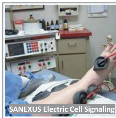
SANEXUS Electric Cell Signaling

Straight to Health Center of Fort Myers, 5245 Big Pine Way, Suite 102. We are located just north of the Bell Tower Shops right across the street from the Crown Plaza Hotel in the Minton Building. Give us a call to reserve your appointment today! 239-202-0999