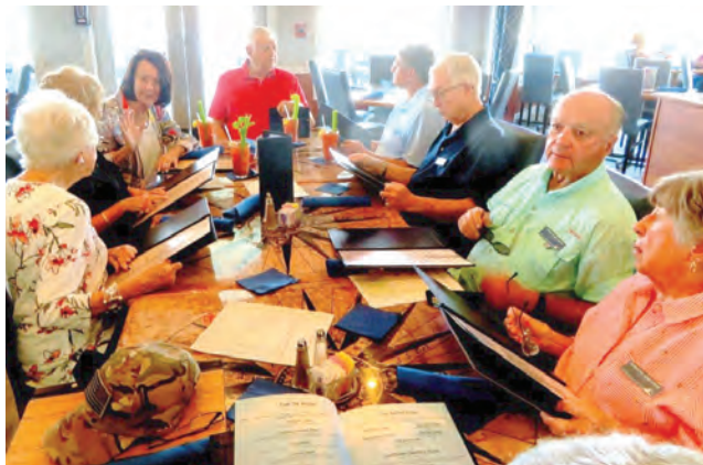
Choices, choices, so many choices