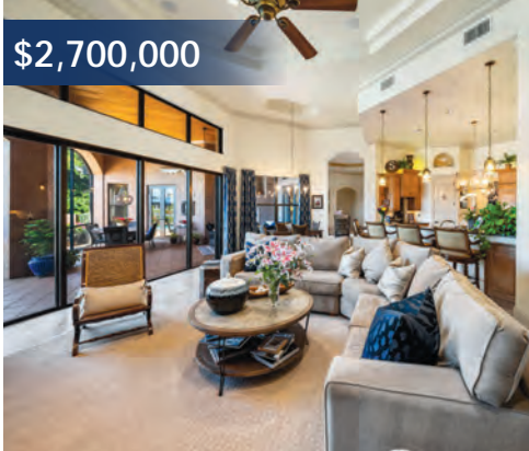
$2,700,000 16231 SHENANDOAH CIR FT MYERS Grand Custom Estate Home