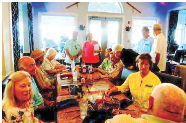
Club members discussed many issues during the business meeting segment of the luncheon.