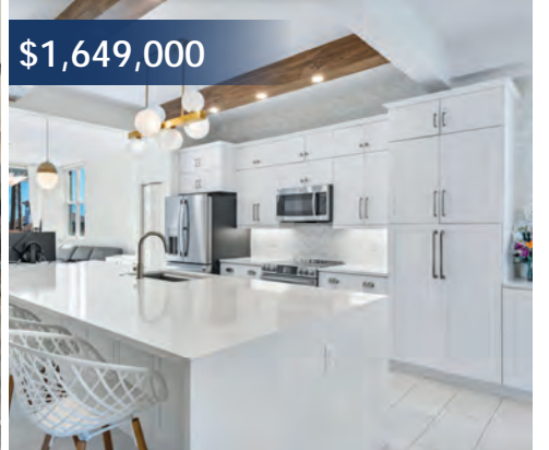
$1,649,000 14200 ROYAL HARBOUR CT 306 FT MYERS Sports Membership Available