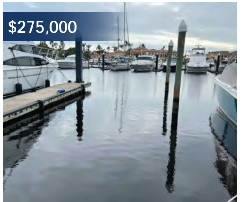
$275,000 GULF HARBOUR BOAT SLIP F20 48 Foot Boat Slip with Amenities