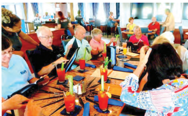
Members study the menus as they enjoy delicious cocktails.