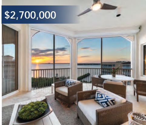
$2,700,000 14270 ROYAL HARBOUR CT 1120 FT MYERS Golf Membership Available