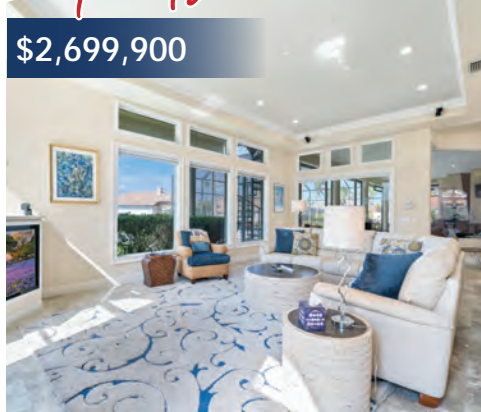
$2,699,900 11511 WELLFLEET DR FT MYERS Sports Membership Available