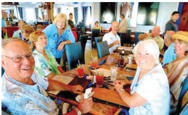
Club members chatted before, during and after eating delicious entrees.