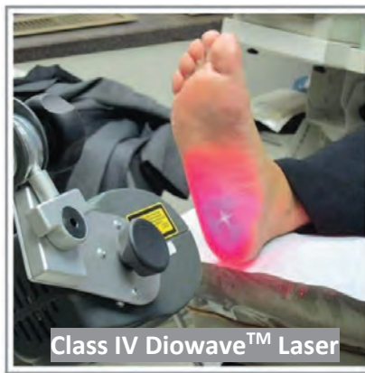
Class IV Diowave™ Laser

ANGIOGENICS™ is a nonsurgical, non-drug treatment for chronic neuropathy, including Diabetic Neuropathy, Chemotherapy Induced Neuropathy and Spinal Neuropathy (Sciatica, Stenosis). It stimulates healing of damaged nerves in the hands and feet by increasing uptake of blood and oxygen. Over time the treatment helps your body grow new blood vessel and nerve cell connections and stimulates proper nerve activity. Over time these treatments help your body grow new blood vessels, nerve tissue, and halts loss of cartilage. Pain, numbness, tingling & loss of function can be helped with this approach and most patients feel improvement in as little as two weeks.