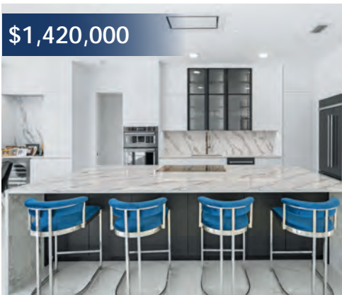
$1,420,000 11461 COMPASS POINT DR FT MYERS Beautiful Updates