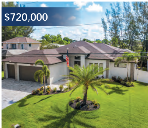
$720,000 4119 NW 20TH ST CAPE CORAL New Construction