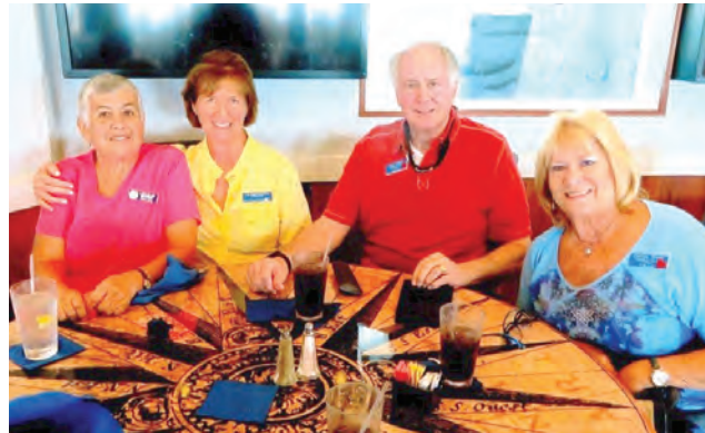
We are so happy to be together once more.