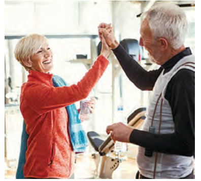
Healthy aging and exercise programs can be great ways to keep fit and have fun.

Going to the gym can be a daunting task if there’s no gym close by, if the weather is bad, or you don’t have transportation. Fortunately, some Medicare Advantage fitness programs include access to on-demand workout videos you can do