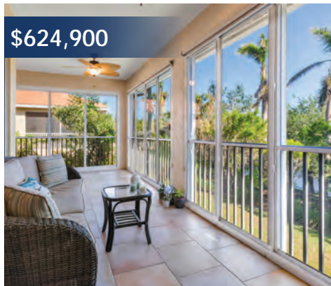
$624,900 11041 HARBOUR YACHT CT 3 FT MYERS Sought After Mariposa