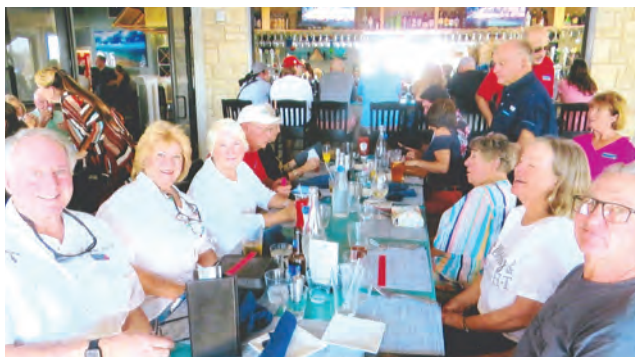
Club members were thrilled to see each other at the December event.