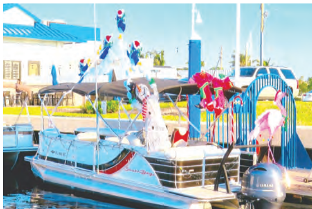
The boat waits to participate in the boat parade.