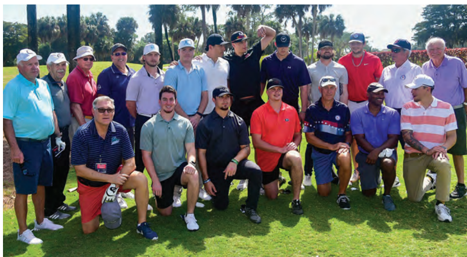
2022 celebrity photo

Established by Lee Health in 1994, Golisano Children's Hospital of Southwest Florida has been named a "Top Hospital" three times by The Leapfrog Group. It is the only recognized children's hospital between Tampa and Miami. Lee Health opened the new 134-bed Golisano Children's Hospital in May 2017, relocating the children's hospital from the adjacent HealthPark Medical Center. It includes comprehensive pediatric services including a 24-hour pediatric emergency department, hematology-oncology unit, milk lab, Regional Perinatal Intensive Care Center, and Level II and Level III NICU with 70 private rooms. Golisano Children's Hospital is proud to have been named Soliant's 2018 Most Beautiful Hospital in the United States, a recognition determined by popular vote. Since 2019, Golisano Children's Hospital has been a proud member hospital of the Children's Miracle Network. For more information, visit GolisanoChildrensSWFL.org .