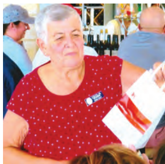
And the first winner is...