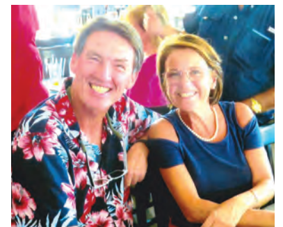
This happy couple won the third prize.