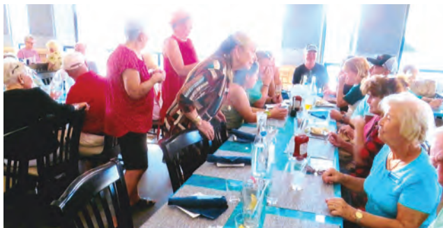
Everyone was anxious to buy 50/50 tickets.