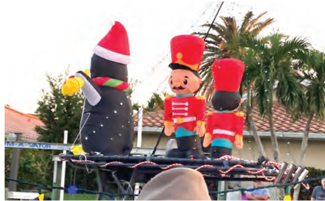
Toy soldiers and a penguin lit up the night.

to thank all the residents who participated in the parade or helped to make the season bright with the wonderful home decorating and lighting displays plus friendly holiday greetings all along the canals and docks.