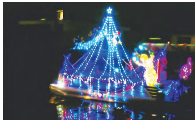
Christmas boat parade participants lit up the night on Dec. 15.