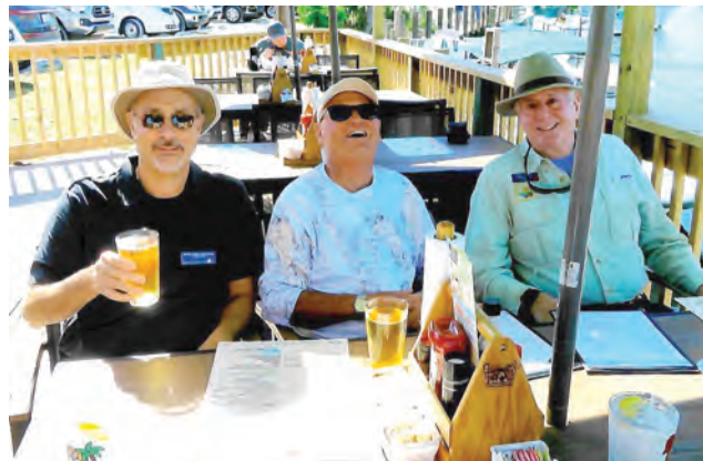
The "3 Amigos" enjoyed the social time before lunch.