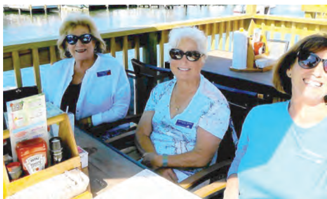
These members discussed the many menu options.

Cruise Club Visits Pine Island on page 2