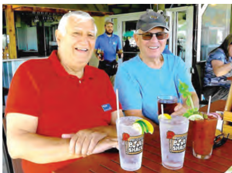
Cocktails and conversations are fun.