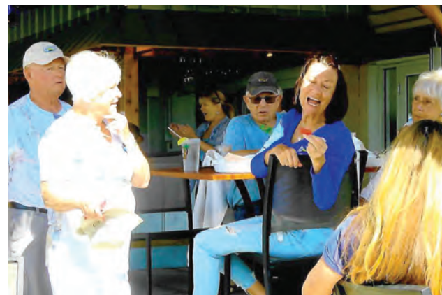
Ellen announces the 50/50 winning number.