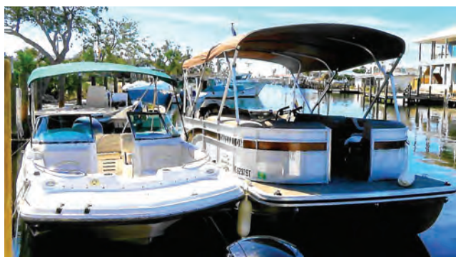
Many of our boaters enjoyed the beautiful cruising weather.