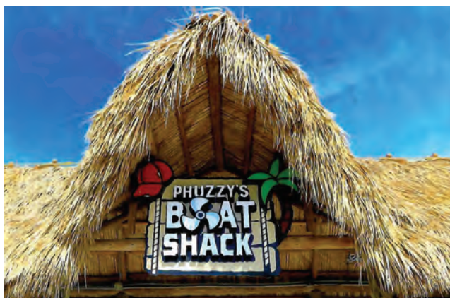
Phuzzy's welcomed the T&R CC members warmly.