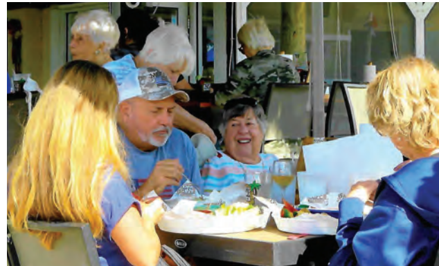
Members were delighted with their delicious entrees.