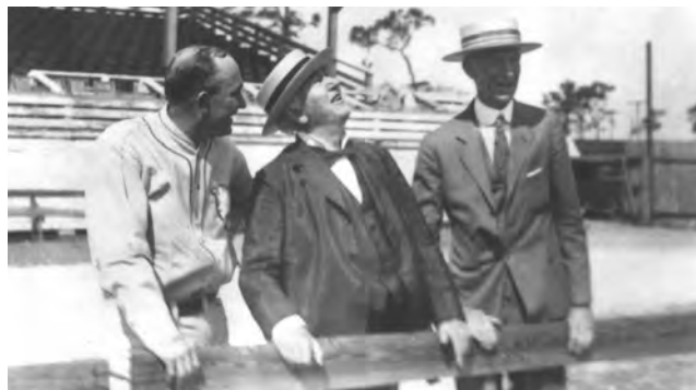
Ty Cobb, Thomas Edison, and Connie Mack at Terry Park in 1927.

The game coincides with major league baseball spring training that is now locally played at JetBlue Park, the Lee County Sports Complex and Hammond Stadium; however,