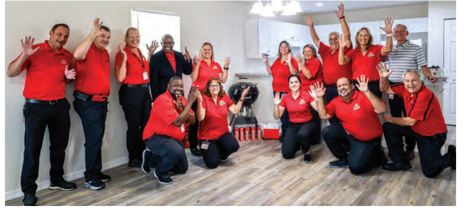
Coke Florida team