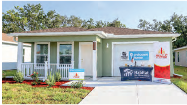
First home dedicated in Habitat's Prospect Avenue Neighborhood

Community leaders, sponsors, volunteers, donors and Habitat staff welcomed a single mother of six to her new Habitat home during a dedication ceremony on June 27. Two of Christie Sowell's children are grown and have moved out, but the mother and four school-aged children had been living in a cramped two-bedroom apartment. Three of the children were using a triple bunk bed to share one bedroom. Now, their newly built Habitat home accommodates the entire family, featuring four bedrooms and more than 1,400 square feet of living space.