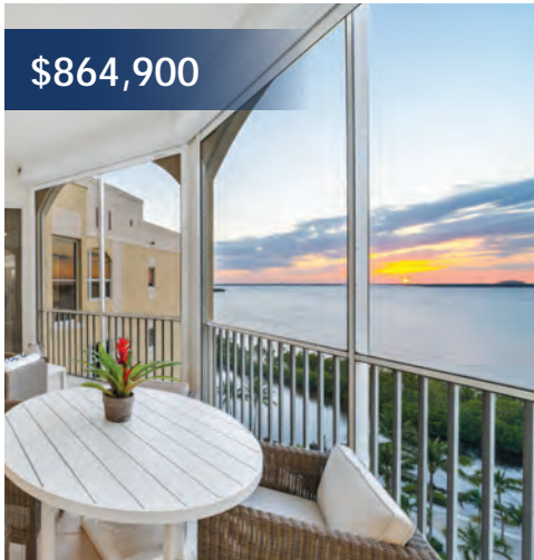
14334 HARBOUR LINKS CT 7B OVERSIZED 2 CAR GARAGE