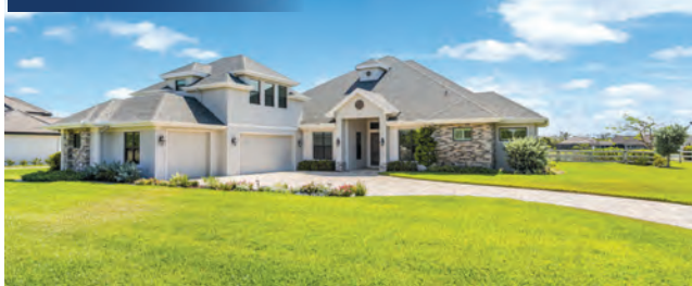
16281 SHENANDOAH CIR Stunning showpiece estate home