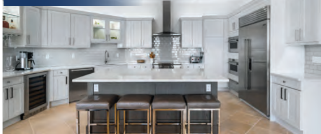
14270 ROYAL HARBOUR CT 1120 Exceptional riverfront vistas & fine finishes