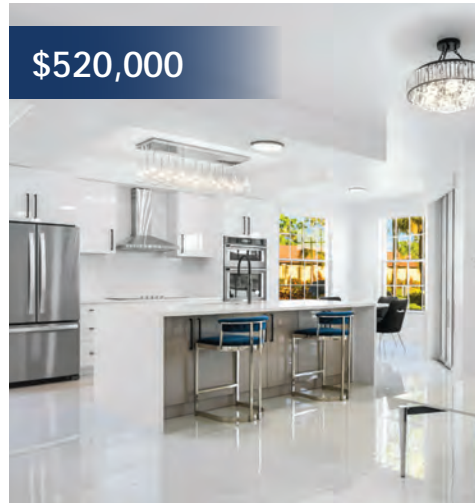
15081 TAMARIND CAY CT 1007 First Floor condo with garage