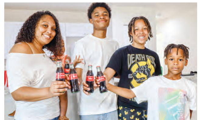
Family personalized Cokes

Company by Deloitte Private and The Wall Street Journal for two consecutive years. Coke Florida is also one of the largest minority-owned businesses in Florida, and the fourth largest Black-owned business in the United States. The company was founded in 2015 and is headquartered in Tampa, Fla. For more information, visit www.cokeflorida.com .