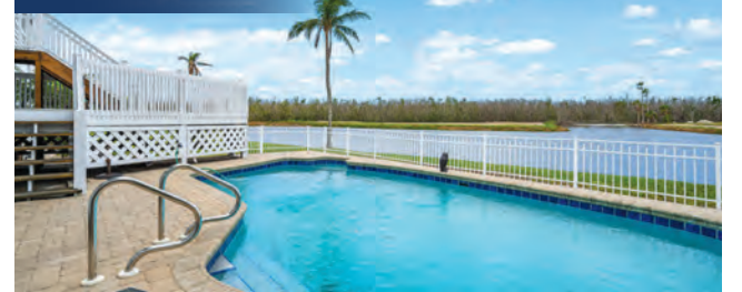
1558 SAND CASTLE RD Sanibel Island lake & golf views