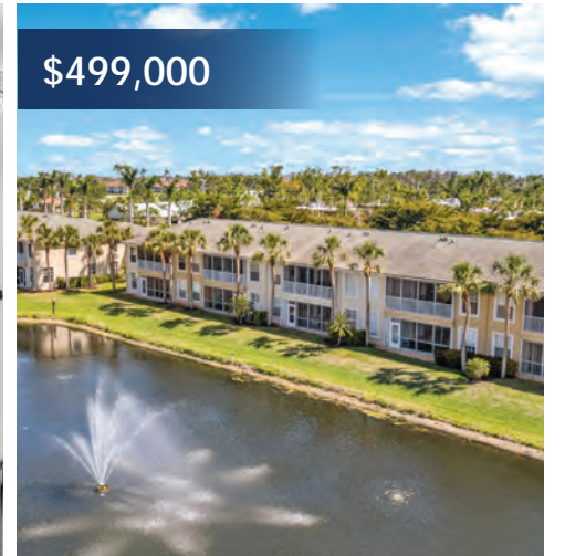
14531 GRANDE CAY CT 3004 Panoramic lake front views

Superior Customer Service is Not Expensive, it's Priceless.