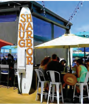
On Oct. 14, members of the Town & River Cruise Club met at the Snug Harbor waterfront restaurant.