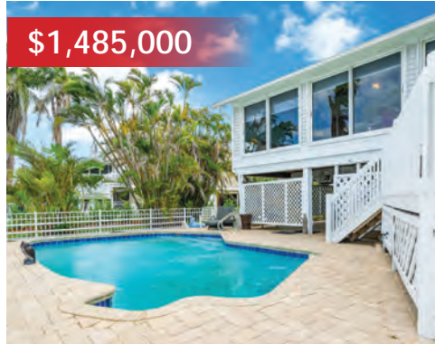
14211 FARRAGUT CT FT MYERS Best View in Admiral's Isle