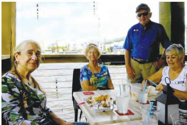
As always, the food was delectable.