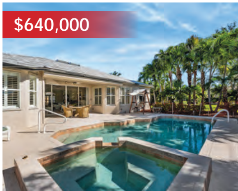
930 S TOWN AND RIVER DR FT MYERS Lakefront So. Exposure Pool Home