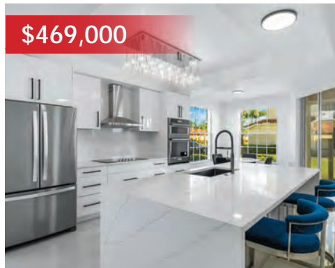
14011 VILLAGE POND DR FT MYERS Hurricane Protection & New Roof