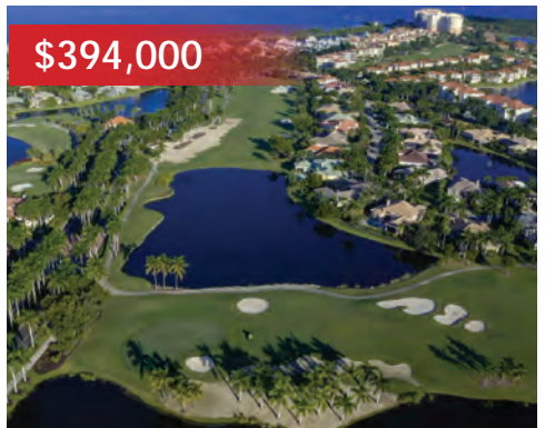
15081 TAMARIND CAY CT 1007 FT MYERS Newly Renovated First Floor Condo