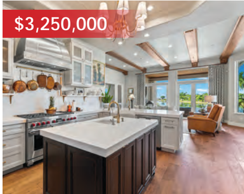
11250 LONGWATER CHASE CT FT MYERS Inspired Waterfront Estate Home