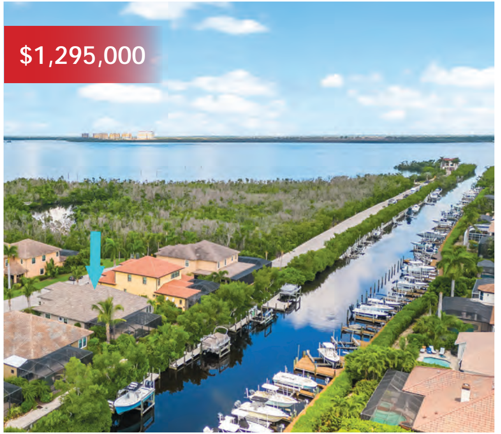
GULF HARBOUR MARINA BOAT SLIP H3 FT MYERS You do not have to own a Gulf Harbour home to own a boat slip! Condo & Master Association fees provide Marina Center & Community Access. 38 Foot Boat Dock with electric, pump out, fuel, full-time staff & more. Direct Gulf access.