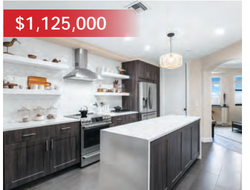
1558 SAND CASTLE RD SANIBEL Live the Island Life