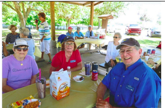
Snacks, games & conversations