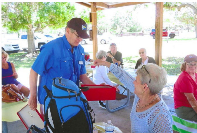
A guest picks the winning ticket of the 50/50 drawing