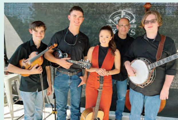
Duck Wallow Lane bluegrass band

Alliance For The Arts, 10091 McGregor Blvd., Fort Myers, FL 33919, (239) 939-2787.