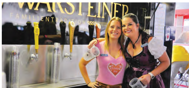
Plenty of beverages, imported German Bier, domestic beer, German wine and spirits, non-alcoholic beer, soft drinks and bottled water

Your ticket also includes admission for the day to Oktoberfest, a dinner at Von Steuben Hall, a filled glass Bier stein with up to five refills, a special Jägermeister drink, and a curated gift bag.