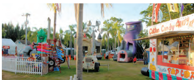
Carnival area for kids

The VIP tickets are available online only . Visit https://capecoraloktoberfest.com/vip-experience .