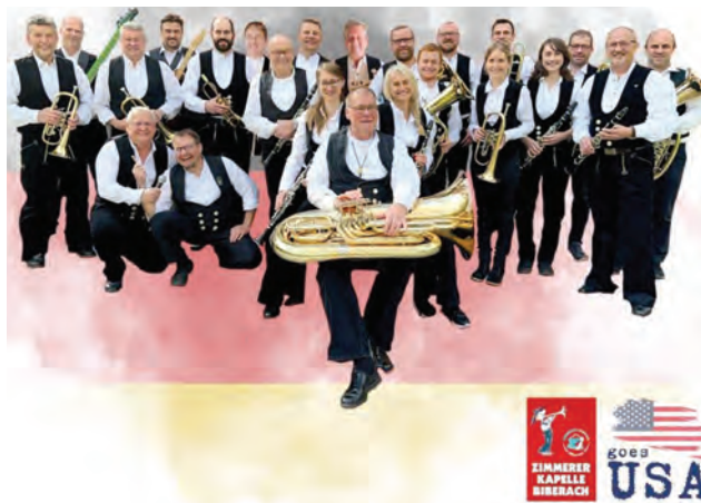
Festival tent and outside Biergarten – three stages, two dance floors, nonstop live bands and German music

Advance tickets: $8, At the gate, $10, Children 12 and under admitted free . All event dates are rain or shine. (Ticket prices subject to change.)